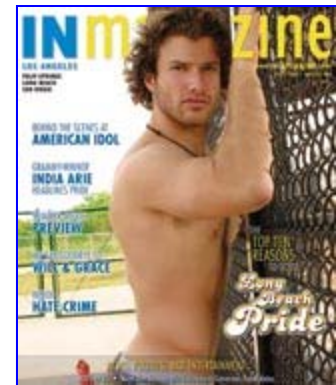
Volume 9 Issue 7 May 19 - June 2, 2006

ry Job 05-31-06Henry M. Paulson Jr. is expected to face immediate international c